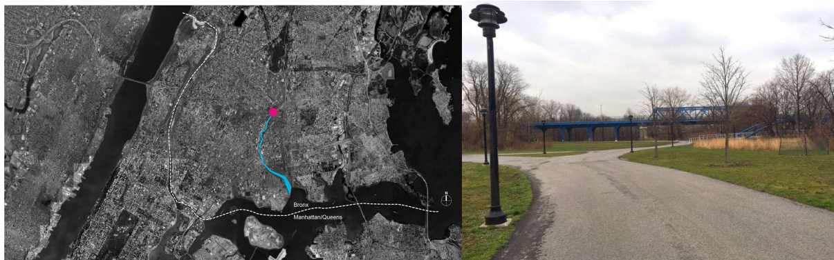
Location Plan / Regional Site

This opportunity is made possible through a grant from the Lincoln Center Cultural Innovation Fund, a pilot program designed to support creative strategies to increase cultural engagement, cultural opportunities and choices for people representing the diverse demographics of the South Bronx. As one of a select group of Bronx organizations awarded this grant, BRAC proposed an innovative project to activate a new, but as yet unprogrammed, centrally located segment of the 8-mile-long Bronx River Greenway.